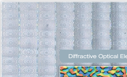
Diffractive Optical Element